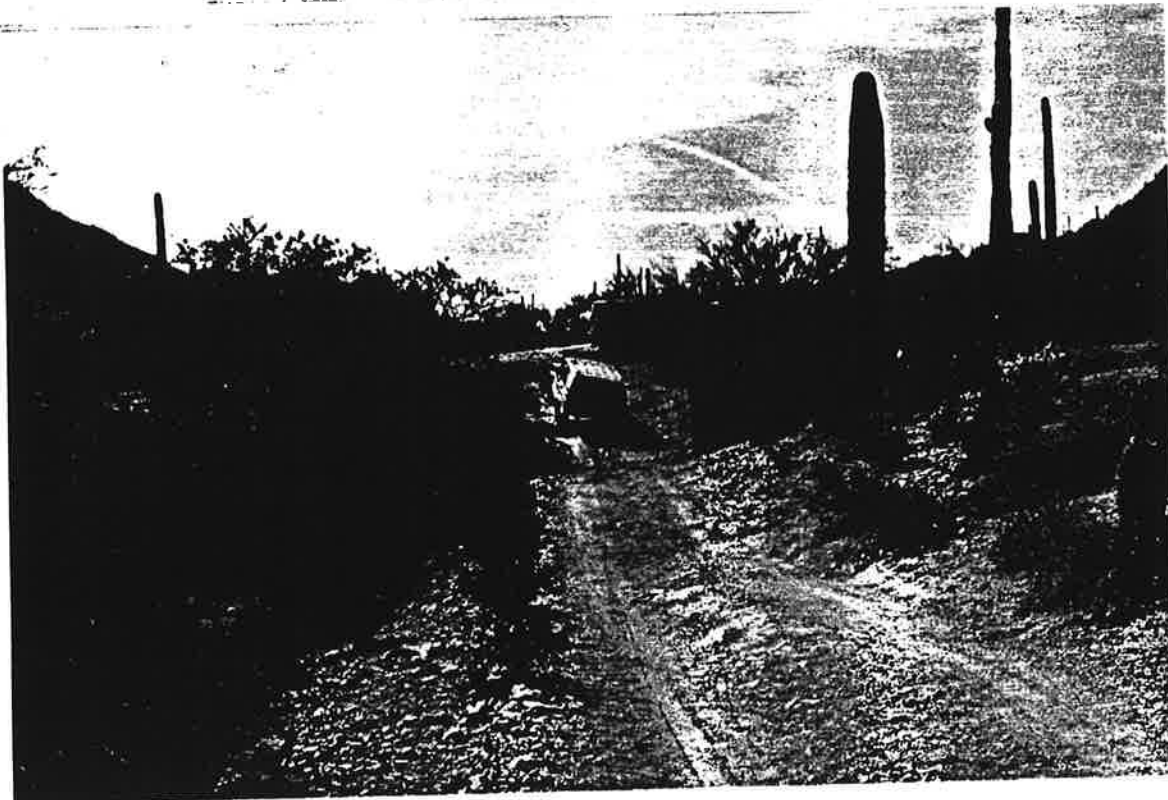
Rolling Westward, ever Westward, near summit of Butterfield Pass

Air Cond. Rooms -In Room Refrigrator Upon Request-Remote Color TV & HBO Cable-Direct Dial Touch Phones-Pool-Non Smoking Rooms-Restaurant & Lounge Included Comp. Cocktail-Corporate & Sr. Citizen Disc.-Most pets accepted-Fax-Copier- 1200 Sq.Ft. Suite 2 Bdrm.