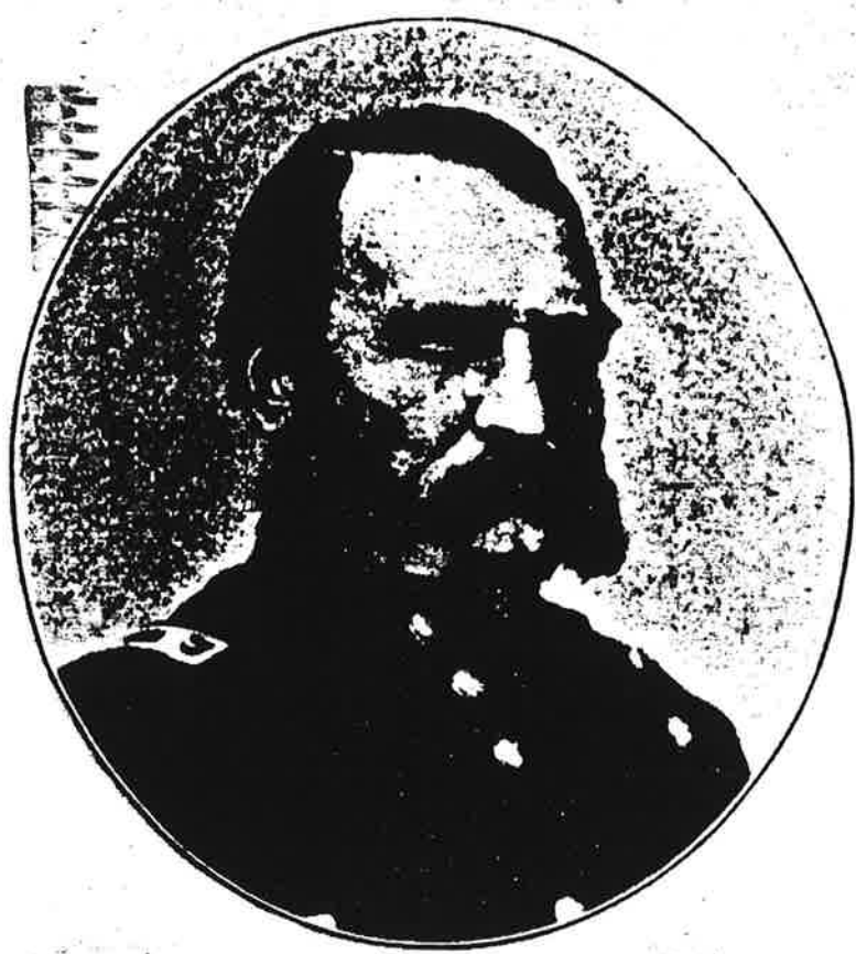
Major William H. Emory of the Corps of Topographical Engineers.