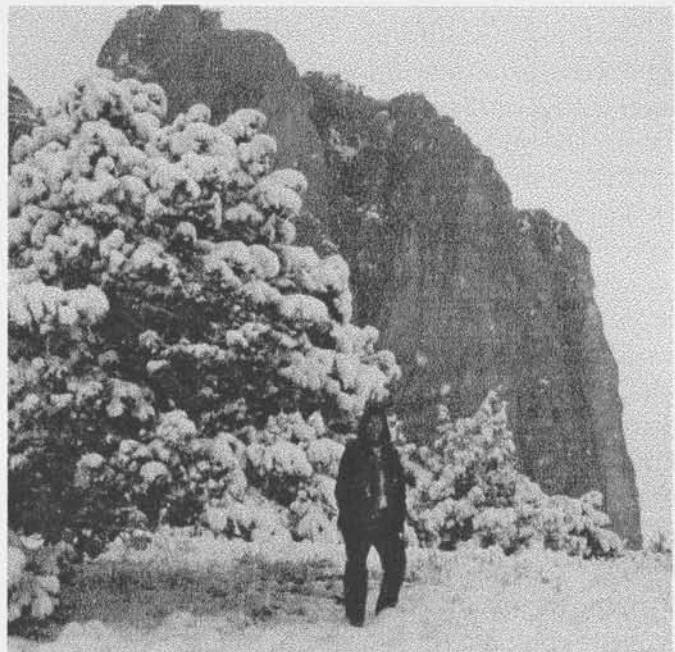
BEALE ROAD - April, 1988, found us at El Morro Nat'l Monument in New Mexico; the outing remembered for its snowfall.