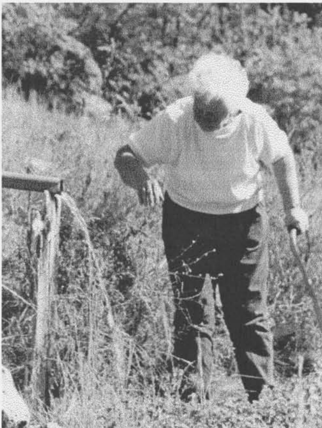
SOUTHERN TRAIL - April, 1992. A rare opportunity to see parts of Gaudalupe Canyon on the border of AZ and NM.