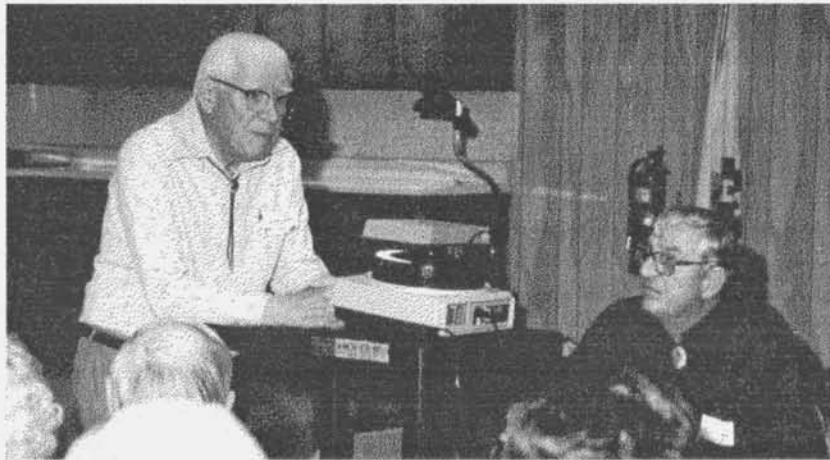
SOUTHERN TRAIL - Nov. 1988. Lunch along the San Pedro River in southern Arizona.