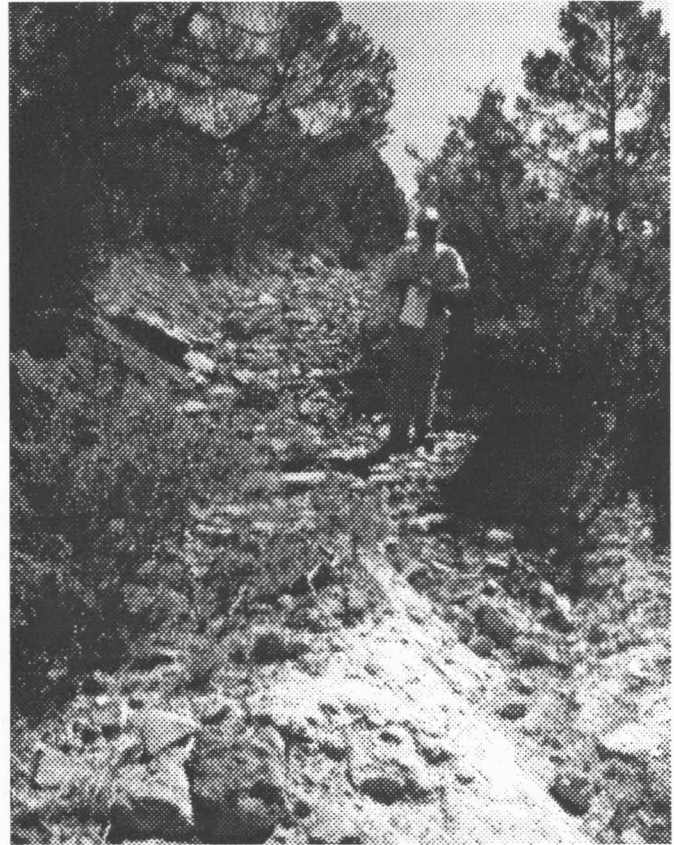
Above: Harland Tompkins stands in the swale of the wagon road leading from the Strawberry valley up to the Rim and north and east.

In 1849 Louisiana Strentzel traveled from Texas to California with her husband and two small children. The following quote is from a letter she wrote to her parents after arriving in California. The party has reached the mouth of the Gila River: