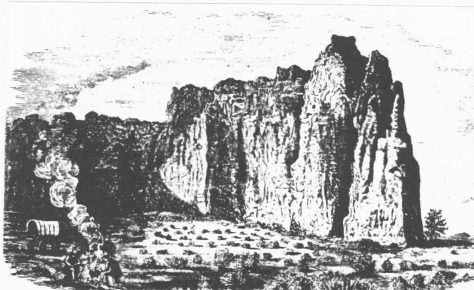
South wall of El Morro